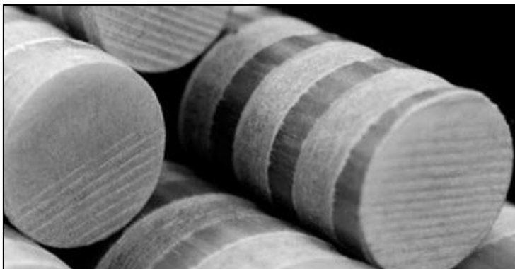
Close-up view of Mateenbar™ Fiberglas™ Rebar – image from Owens Corning Infrastructure Solutions website

www.owenscorning.com/en-us/composites/product/fiberglasrebar